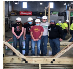
2021 NIACC Design Build